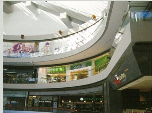
MARINA BAY SANDS ATRIUM PROTECTED BY EKOOL ZSS-25A WATER MONITORS

Distributor : Sprinkler Fire Systems Pte Ltd