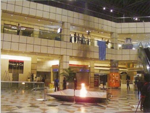
LIVE FIRE/DISCHARGE TEST OF EKOOL ZSS-25A WATER MONITOR AT SUNTEC CITY MALL