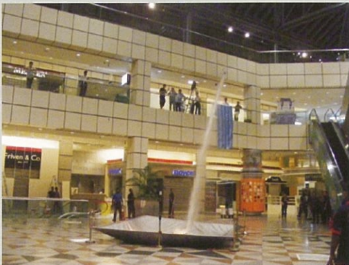
FIRE EXTINGUISHED DURING TEST