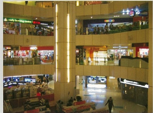
EKOOL ZSS-25A WATER MONITORS AT UNITED SQUARE