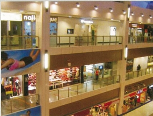
EKOOL ZSS-25A WATER MONITORS AT NOVENA SQUARE